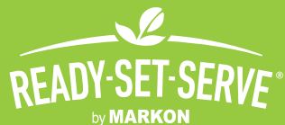
Table-ready fruits & vegetables. Backed by 5-Star.