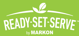
Table-ready fruits & vegetables. Backed by 5-Star.